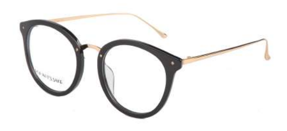
JACKIE GOLD OP281