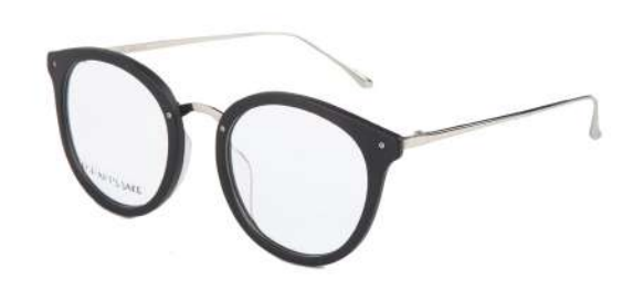
JACKIE SILVER OP282