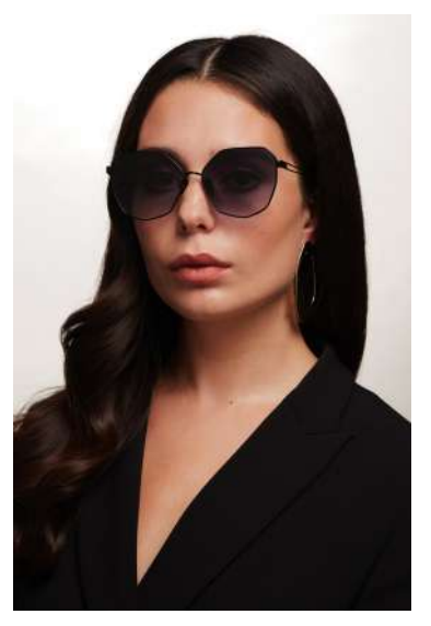
MOMA BLACK KW2