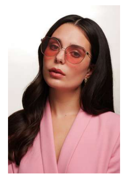
MOMA PINK KW3