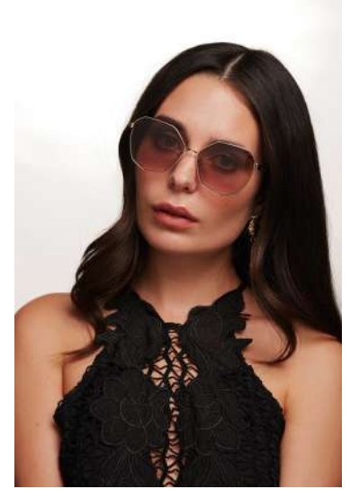
MOMA CHAMPAGNE KW1