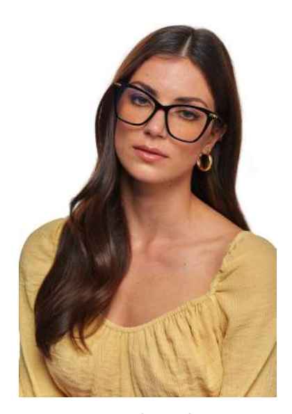
PARIS BLACK OP251